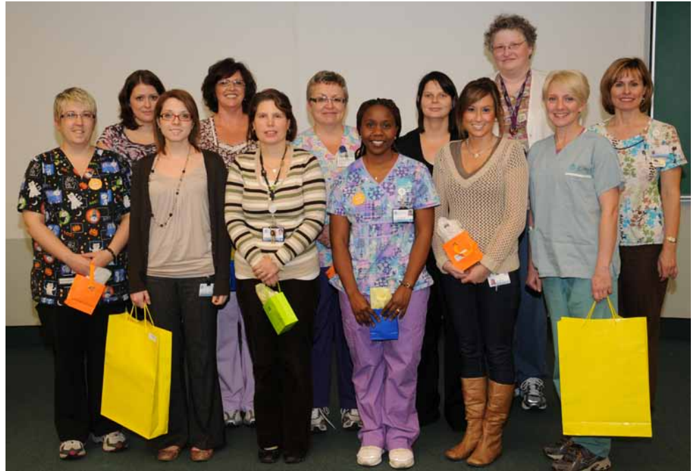
Horizon staff members in Moncton were recognized for academic achievement.

This was the 7 th year for Back to School Days in Moncton and it provided 35 education sessions and presentations of interest to more than 900 attendees from across the Moncton area. A highlight this year was a presentation