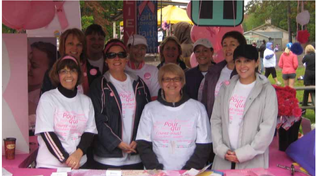
Breast Imaging Staff organized attend the Katherine Wright Center Information Booth at the annual CIBC Run For The Cure in Moncton

cancer and also a model breast to help increase awareness of how a breast lump can feel. The team is already preparing and looking forward to next year's event and booth set-up, which may include a few added features.