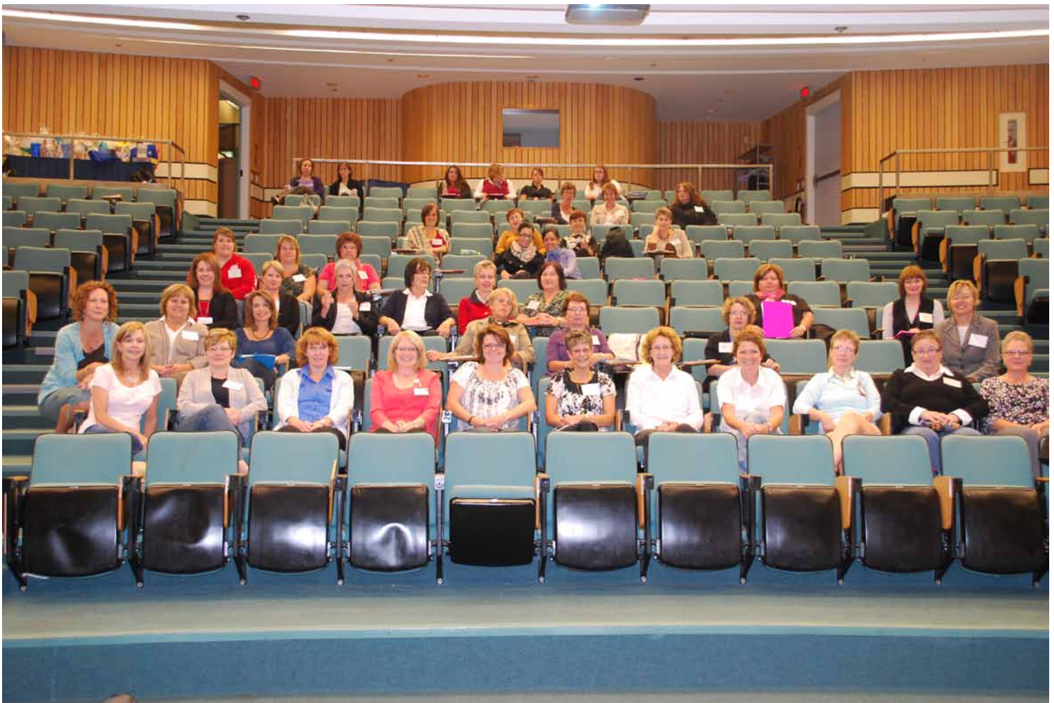
Perianesthesia nurses from across New Brunswick and P.E.I. gather at The Moncton Hospital.

This organization is active in both Horizon Health Network and VitalitéNB under the organization of Perianesthesia Nurses of New Brunswick and Prince Edward Island (PANNB/PEI). If interested in learning more, please visit the national website at www.napanc.org